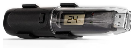
CMDL01 Advanced Data Logger with LCD Display