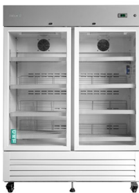
CMRTSG500 500L Glass Door RTS Cabinet