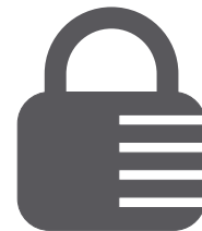
COMBI01 Keyless Combination Lock